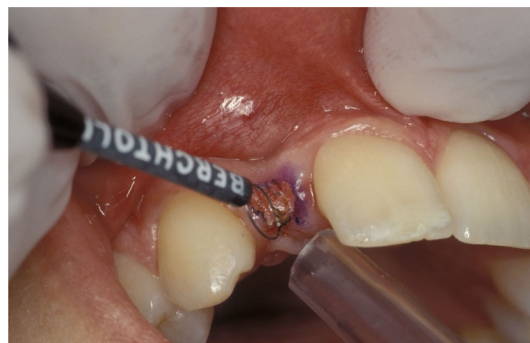
FIGURE 17 After local anesthesia, the soft tissue was reshaped using an electrotome sling for adaptation to the ovate pontic.