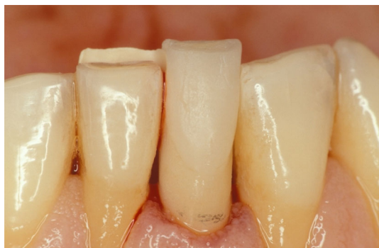
FIGURE 4 After tooth extraction, the length of the pontic was adjusted to the extraction socket so that the pontic base supported the gingival margin circumferentially.