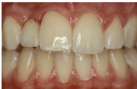
FIGURE 18 Labial view at the day of insertion of the RBFDP