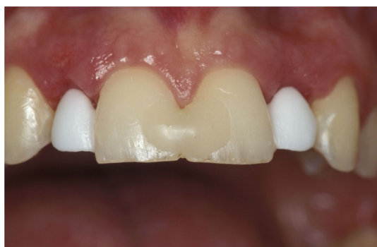
FIGURE 26 Labial view of the try-in of the 3Y-TZP zirconia ceramic framework to be veneered with feldspathic ceramic.

demonstration that bonding to zirconia works in the long term if adequate methods with phosphate monomer containing luting resins were chosen, 7 quickly zirconia ceramic replaced alumina ceramic as framework material for RBFDPs with even better results. 9 The following case illustrates the positive outcome using veneered zirconia ceramic.