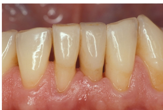
FIGURE 6 Frontal view of the single-retainer all-ceramic RBFDP. Note the initial collapse of the papilla.