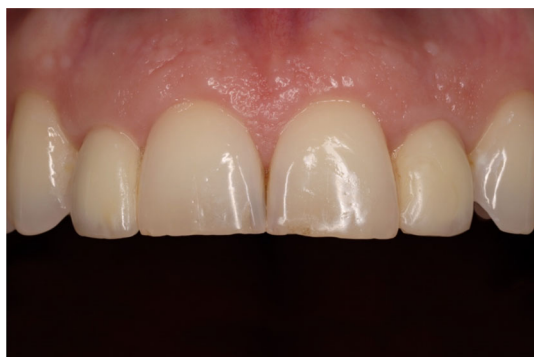
FIGURE 35 Labial view more than 18 years after insertion.