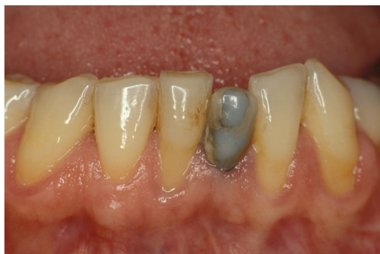
FIGURE 1 Labial view of the mandibular teeth of a 55-year-old male patient. The endodontically treated and discolored left lower central incisor needed to be replaced because of an external root resorption.

pontic and retainer wing of one abutment tooth leaving the pontic attached as cantilever to the other abutment tooth, which continued to function over the next 10 years. 3