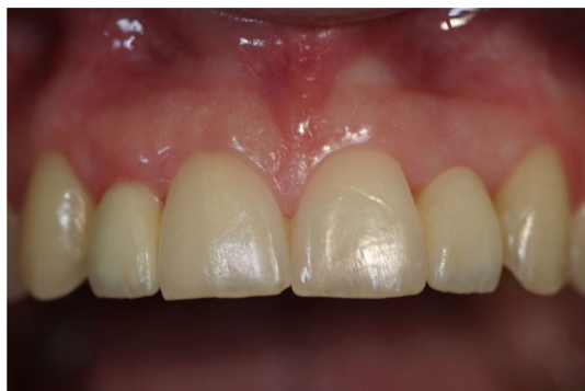
FIGURE 29 Labial view of the inserted RBFDP.