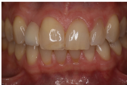
FIGURE 22 Labial view of the RBFDP 26 years after insertion. Note the considerable color difference between the pontic and the natural dentition.