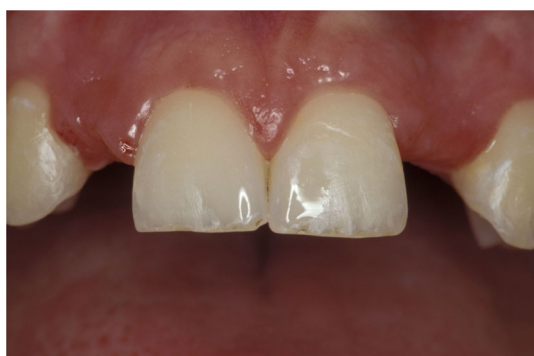
FIGURE 24 The labial view reveals tissue excess in vertical dimension.