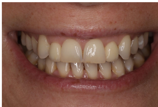
FIGURE 34 Smile of the patient more than 18 years after insertion.