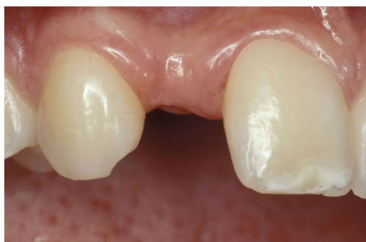
FIGURE 14 The edentulous space showed slight soft tissue excess in vertical direction but a moderate ridge defect in horizontal direction.