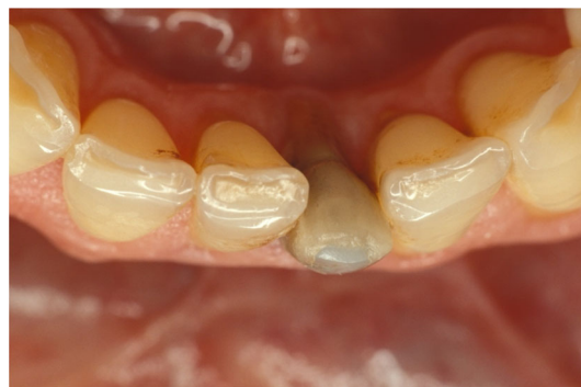
FIGURE 2 Preoperative occlusal view. The tiny composite resin filling at the disto-lingual surface was fully included into the tooth preparation.

The RBFDPs had been fabricated with a minimum retainer wing thickness of 0.7 mm, a minimum connector height of 3 mm, and a minimum connector width of 2 mm. The presented cases exemplarily show that the concept of cantilevered RBFDPs does not only functions very well long-term but also does not result in clinically relevant loss of hard and soft tissues in the areas of the missing teeth as it is often claimed. 10,11 It also does not bear the risk of frequent long-term complications seen with implant-retained crowns such as periimplantitis, crown infraposition, and missing proximal contact points, 12,13 which might compromise esthetics and restoration function for the patient considerably.