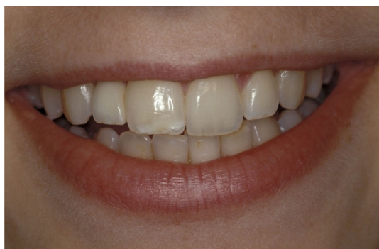
FIGURE 20 Smiling 15-year-old patient.