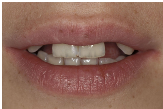
FIGURE 23 Extraoral view of a 20-year-old female patient with congenitally missing maxillary lateral incisors.