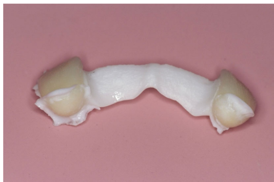
FIGURE 27 The fit checking silicone at the final try-in of the finished RBFDP indicated a broad ovate pontic contact area.