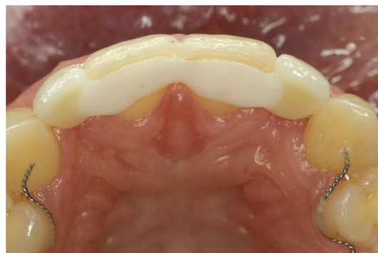
FIGURE 28 Occlusal of the inserted RBFDP.

in order to avoid interference of the retainer wings with the existing canine guidance in a deep bite situation where the incisors allowed insertion of the retainer wings due to the existing overjet. The framework was veneered with feldspathic ceramic and the pontics were designed to provide an ovate pontic with an extensive soft tissue contact as revealed by a fit checking silicone (Figure 27). The finished RBFDP was inserted under rubberdam isolation with a phosphate monomer containing luting resin (Panavia 21 TC, Kuraray) after air-abrasion of the bonding surfaces with 50 \mu m alumina particles at 0.25 MPa pressure. The alumina particle abrasion cleaned, roughened