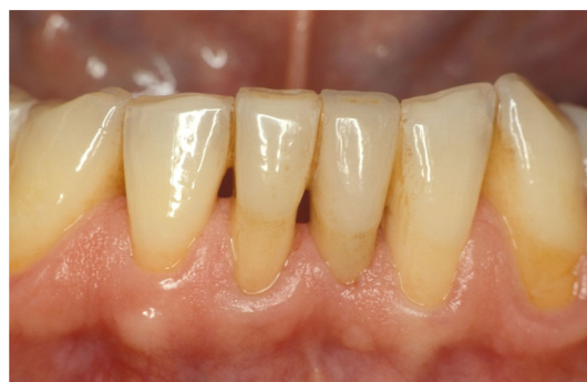
FIGURE 7 Frontal view of the restoration at a 9 month recall visit. Note the nearly complete recovery of the papilla.