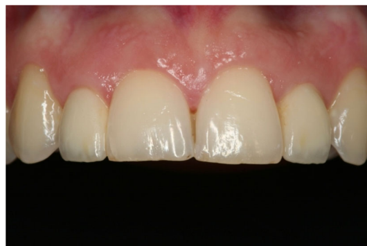
FIGURE 32 Labial view 1 year after insertion.

and activated the zirconia ceramic bonding surfaces. 21 Then the labial composite resin splinting of the incisors was removed (Figures 28 and 29). The patient and the treatment team were satisfied with the esthetic outcome achieved in 2004 (Figures 30 and 31). At the recall 1 year later, the soft tissues had been matured and the pontic emerged naturally from the gingiva (Figures 32 and 33). The patient was at regular recall at her home dentist in the city of Lübeck in Northern Germany in the following years and only showed up only in 2019 after chipping of the incisal edge of the left pontic after 15.5 years when multiple repair attempts of her home dentist were unsuccessful. The intraoral repair was successfully made after