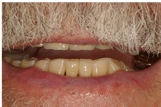
FIGURE 10 Labial view of the now 81-years old patient.