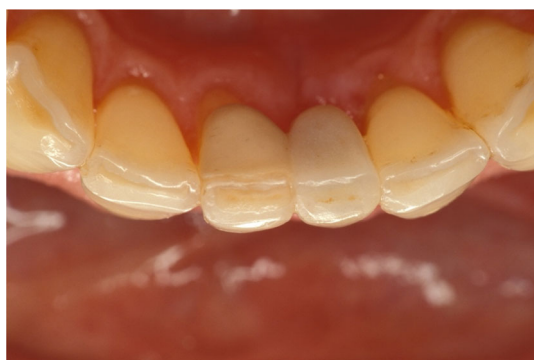
FIGURE 8 Occlusal view of the single-retainer all-ceramic RBFDP.

result of the all-ceramic RBFDP is shown after 1 week (Figure 6) and 9 months (Figures 7 and 8) of insertion. After 9 months both papilla at the extraction side had nearly completely remodeled. The radiographs show the extraction socket and the adjacent teeth after 1 week, after 6 years, and after 23 years (Figure 9). Initially the patient flossed regularly under the ovate pontic. However, the patient was then in recall at his home dentist over the following years and stopped flossing under the pontic at some point. In