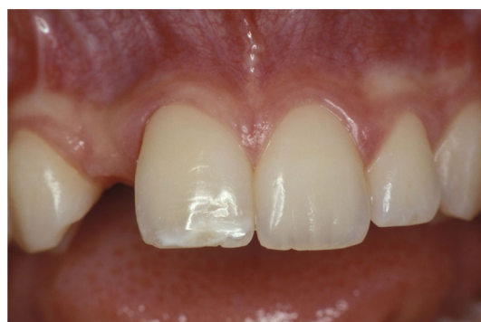
FIGURE 13 Labial view of a 15-year-old female patient with unilaterally congenitally missing maxillary right lateral incisor.