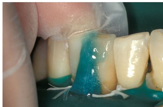
FIGURE 5 The all-ceramic RBFDP was held in place with finger pressure until the luting composite resin had set.

result of the all-ceramic RBFDP is shown after 1 week (Figure 6) and 9 months (Figures 7 and 8) of insertion. After 9 months both papilla at the extraction side had nearly completely remodeled. The radiographs show the extraction socket and the adjacent teeth after 1 week, after 6 years, and after 23 years (Figure 9). Initially the patient flossed regularly under the ovate pontic. However, the patient was then in recall at his home dentist over the following years and stopped flossing under the pontic at some point. In