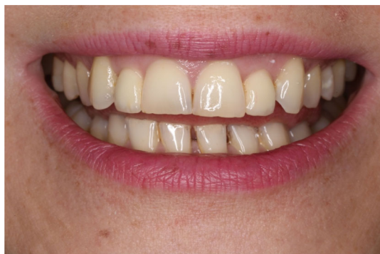
FIGURE 33 Smile of the patient 1 year after insertion.