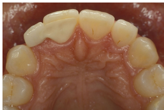
FIGURE 19 Occlusal view at the first recall visit