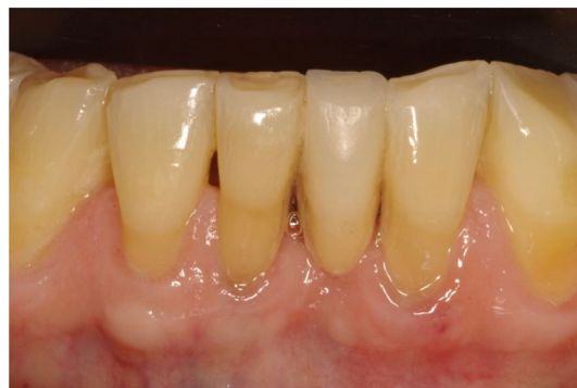
FIGURE 11 Frontal view of the RBFDP 26 years after insertion. Note the clinically not relevant loss of hard and soft tissue caused by physiological aging.

A 15-year-old female patient presented with a congenitally missing maxillary right lateral incisor (Figure 13). The edentulous space showed slight soft tissue excess in vertical direction but a moderate ridge defect in horizontal direction (Figure 14). After minimally invasive preparation of the abutment tooth within the enamel and impression taking (Figure 15), the single-retainer alumina ceramic RBFDP was fabricated with a copy-milling technique and labially