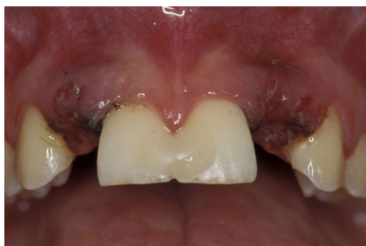
FIGURE 25 Labial view after roll flap surgery to broaden the ridge in horizontal direction and to create a concave depression in the soft tissue for the ovate pontic.