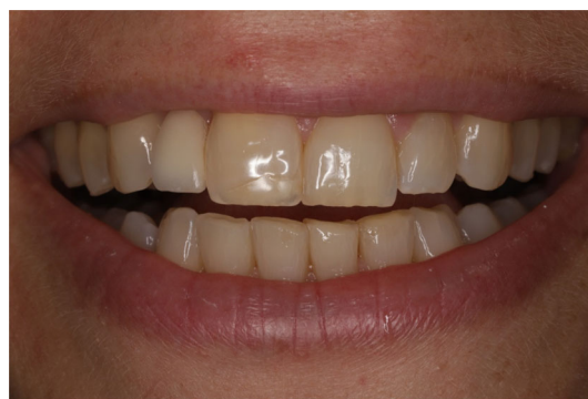
FIGURE 21 Smiling 41-year-old patient 26 years later.

respects the biological width by leaving enough space for the periosteum, connective tissue, and epithelium. 16 Then, the restoration was inserted with a phosphate monomer luting resin (Panavia 21 TC, Kuraray, Japan) under rubberdam isolation. The soft tissue wound healed against the ovate pontic (Figure 18). At the following recall visit the tissues had healed and the patient was satisfied (Figures 19 and 20). In October 2022 the now 41-year-old patient was met at a café in Cologne (West Germany) and the restoration was inspected (Figures 21 and 22). The soft tissues around the pontic looked healthy and no clinically relevant loss of soft tissue was detected. The RBFDP has never lost retention and no tooth migration or rotation of the pontic has occurred. However, the patient's natural teeth had become