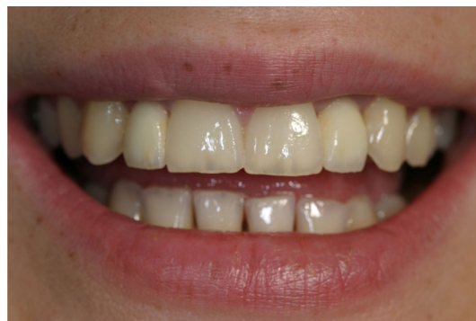
FIGURE 30 Postoperative smile of the patient.