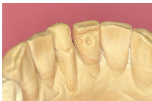
FIGURE 3 View of the master cast demonstrating preparation features including a minimal lingual veneer, a groove on the cingulum and a shallow proximal box preparation. The left central incisor was removed from the master cast with a laboratory bur since the tooth would be extracted directly prior to the insertion of the restoration (immediate pontic technique).