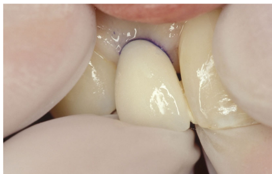
FIGURE 16 Due to the ovoid pontic the soft tissue became ischemic when the RBFDP was tried on.