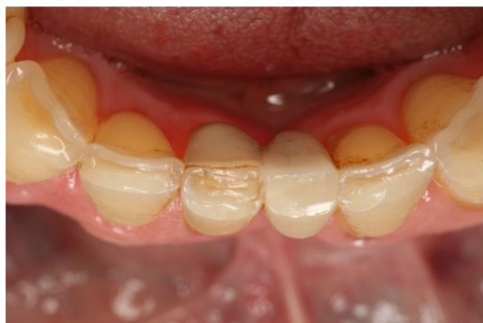
FIGURE 12 Occlusal view of the RBFDP after 26 years.